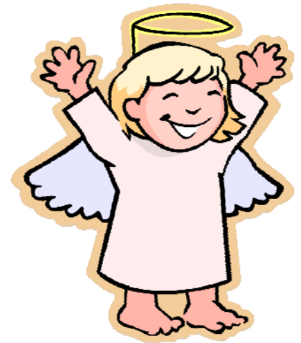
Anne thanks God for the miracles of modern medicine and treat- ments for aneurysms.