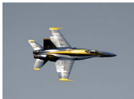
Navy Fighter Plane