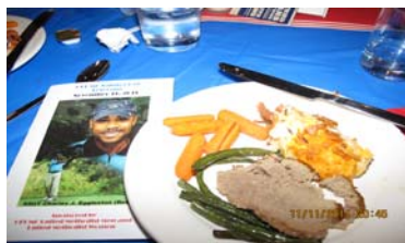
Dinner - Roast beef, carrots, beans, potatoes.