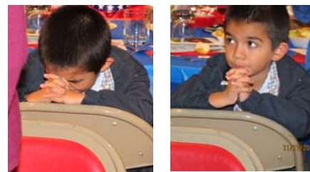
Earnest prayer and a quick peek