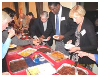
Desserts compliments of United Methodist Women