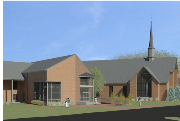
Proposed new Georgia Avenue entrance

A capital campaign is not about heavy-handed tactics, brow-beating, trickery, guilt or high-pressure appeals for money. It is a time for learning, spiritual growth and prayerful consideration of how God would have each one of us respond to the need.